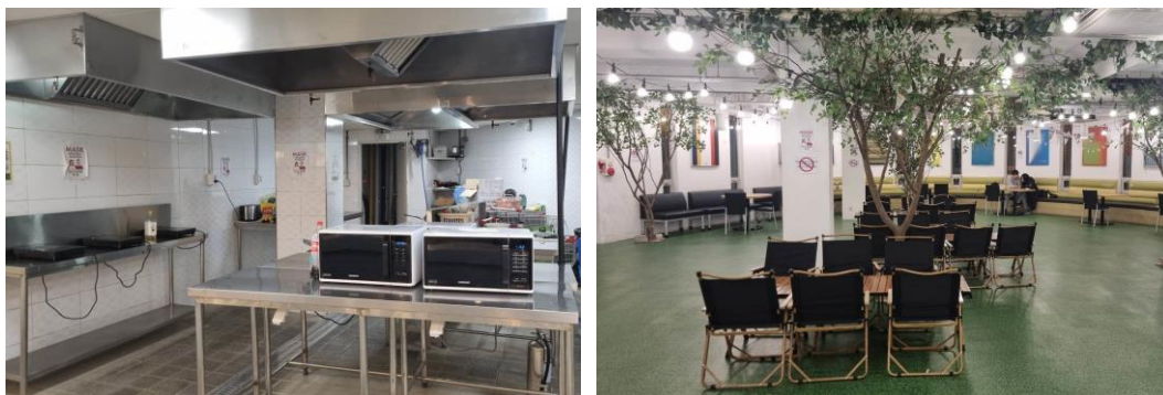
<Community Kitchen & Cafeteria>

The Dormitory and International House provides coin operated laundry rooms and a gym for its residents' use. These are located on the basement floor and open 24 hours. Seminar rooms and participant lounges are also available for the residents. (* Due to Covid-19, the operation hours can be changed or closed without notice.)