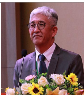
Director General, Climate and Atmospheric Strategy Research Group, Korea Environment Institute (KEI)